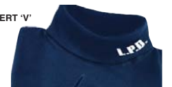
TURTLENECK W/ EMBROIDERY