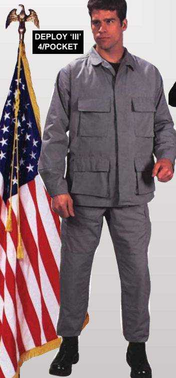
DEPLOY 'III' 4/POCKET

FABRIC: MIL SPEC BATTLE RIP-STOP COTTON BLEND DETAILS: SHIRT; 2/POCKETS, 4/POCKETS, *CONCEALED BUTTONS * BELOW POCKETS * DOUBLE REINFORCED ELBOWS * SHOULDER EPPAULETES DETAILS: TROUSERS; * SIX POCKETS *DOUBLE REINFORCED SEAT & KNEE *DRAWSTRING LEG CLOSURE