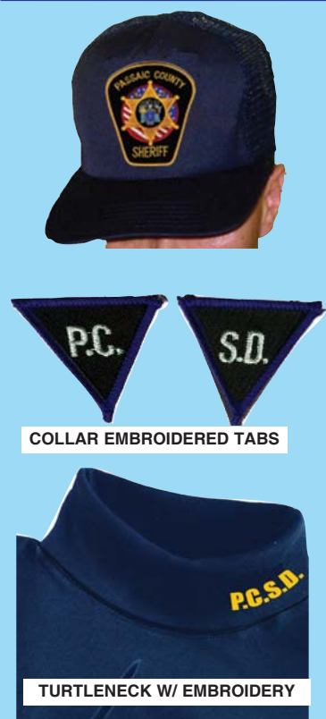
COLLAR EMBROIDERED TABS